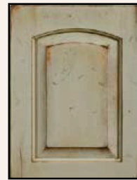
Cottage Green on Brown Maple