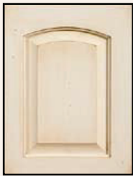
Parchment on Brown Maple