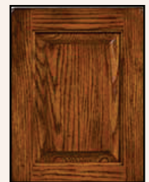
Michael's Cherry on Oak