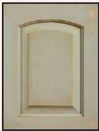
Cottage Green on Brown Maple