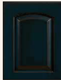
Navy on Brown Maple