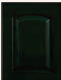
Hunter Green on Brown Maple