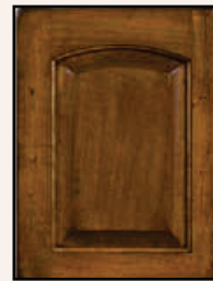
Special Walnut on Brown Maple