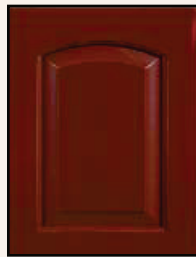
Antique Red on Brown Maple