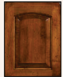
Harvest on Brown Maple