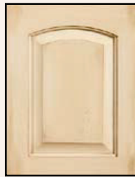
Almond on Brown Maple