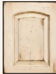
Parchment on Brown Maple