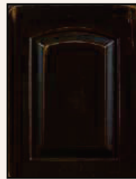
Black on Brown Maple