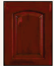
Antique Red on Brown Maple