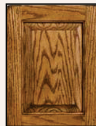
Provincial on Oak