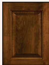
Special Walnut on Cherry