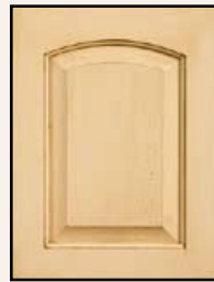
Sandstone on Brown Maple